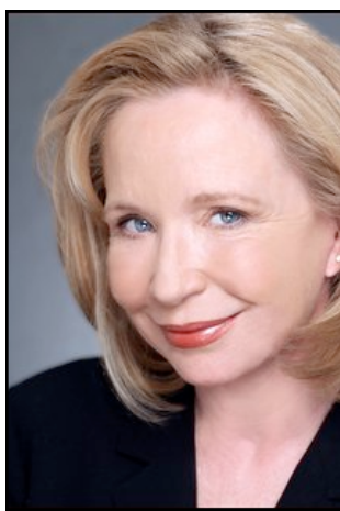
Debra Jo Rupp