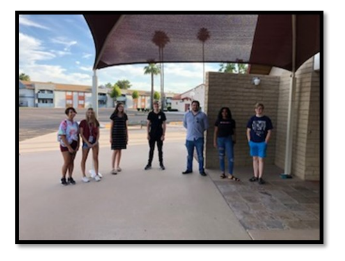
Youth Sunday Participants