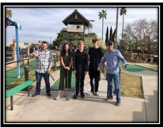
Mini Golf February 2020