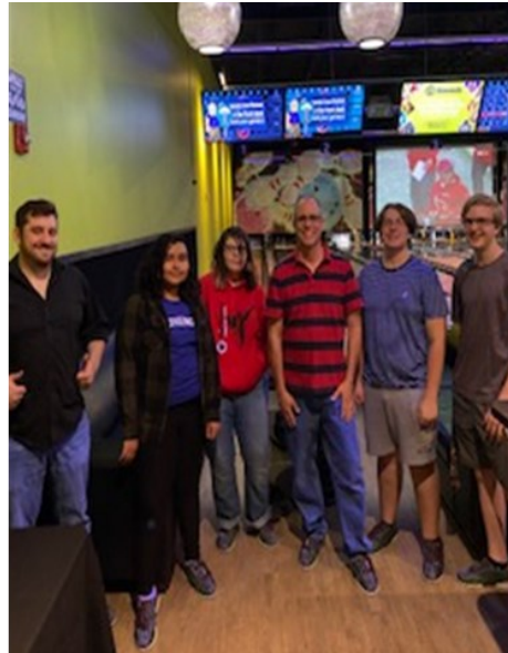
Bowling at Fat Cats