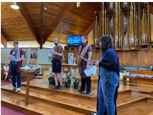
Youth Sunday Skit