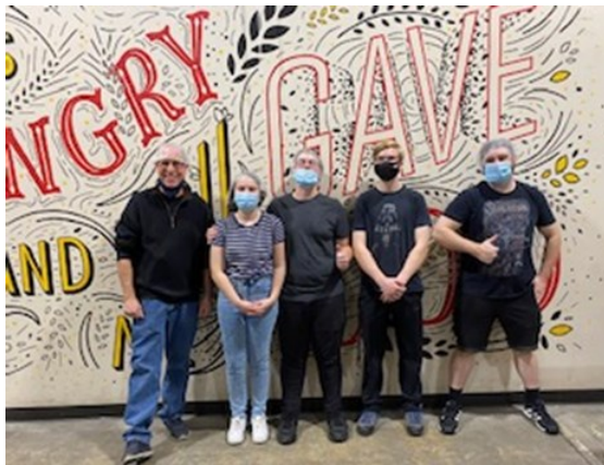
Midwest Food Bank