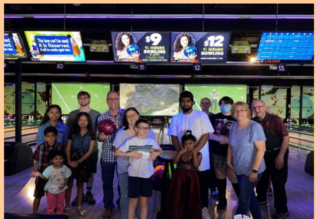
Family Bowling Day at Fat Cats