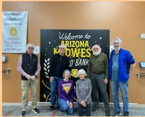
Midwest Food Bank Volunteer Day