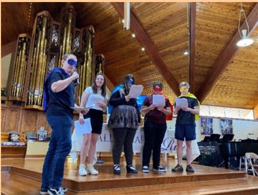
Youth/Young Adult Sunday