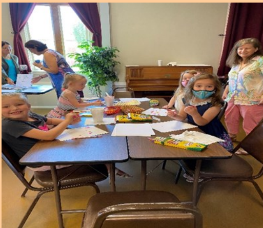
Fall Ministry Fair Kids Activity