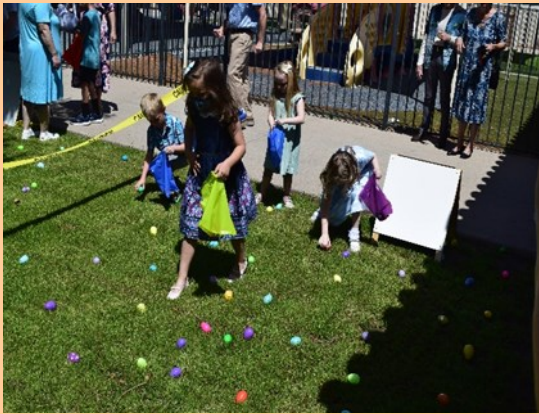
Easter Egg Hunt 2022