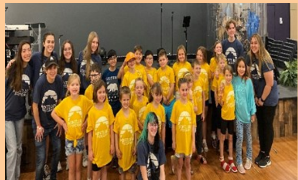
Traveling Day Camp 2022