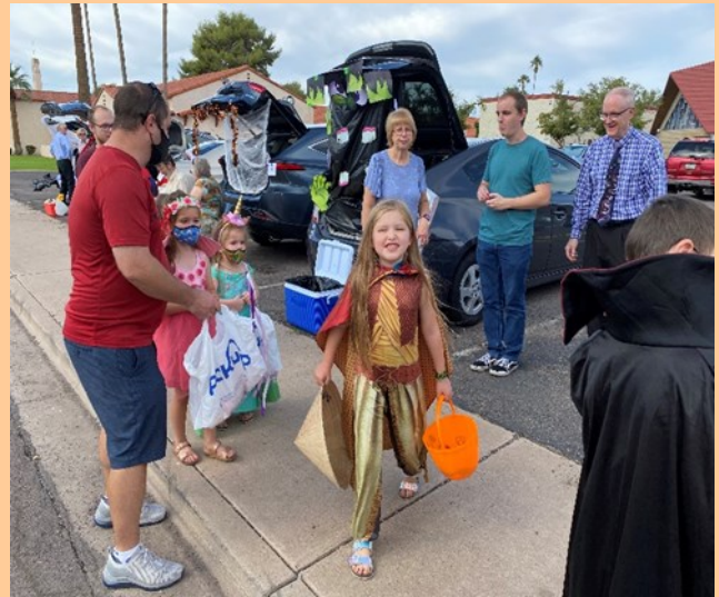
Trunk or Treat Fun