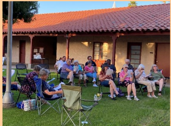
WRAP Closing BBQ 2022