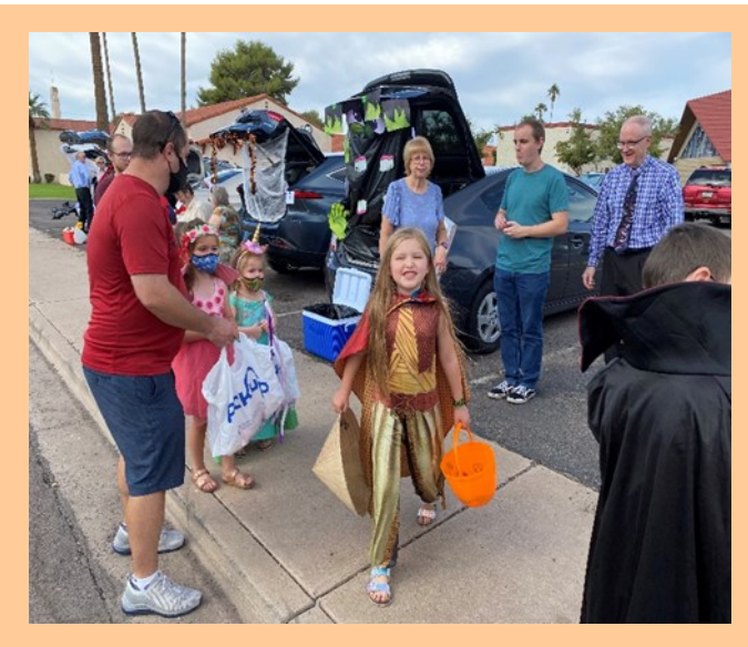
Trunk or Treat Fun