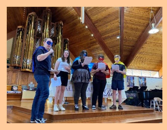
Youth/Young Adult Sunday