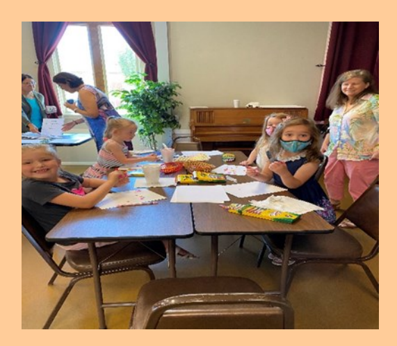
Fall Ministry Fair Kids Activity