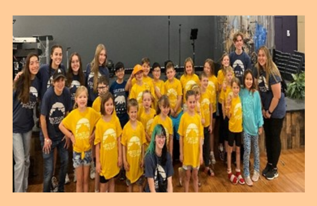
Traveling Day Camp 2022