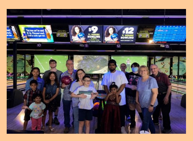
Family Bowling Day at Fat Cats