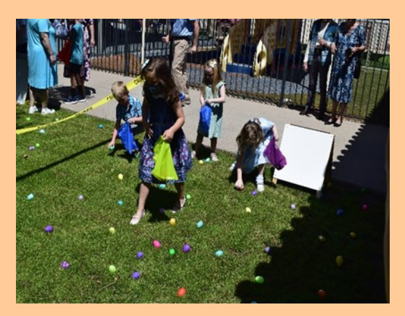
Easter Egg Hunt 2022