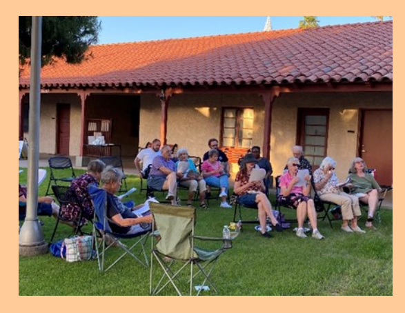
WRAP Closing BBQ 2022