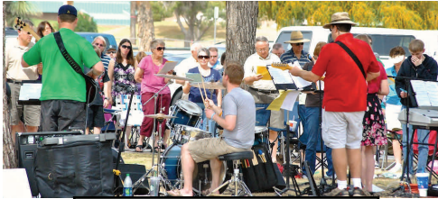
Worship in the Park