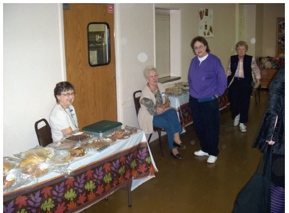
Bake Sale at Craft Fair

2012 has been a busy and rewarding year for PW members as we continue to share our financial blessings and talents to serve God through FPC Mesa. We say, Thank You, to each Staff and Congregational member who continues to support our efforts.