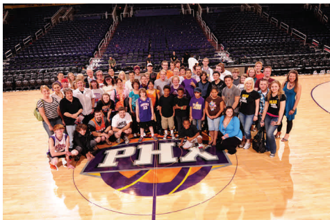
Suns Court of Dreams