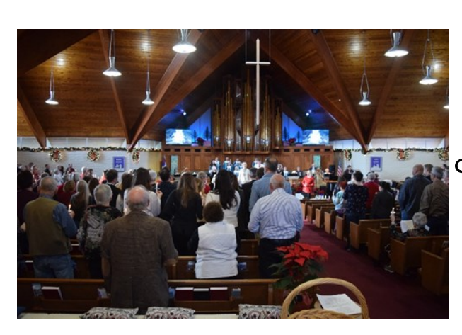
Christmas Eve Service