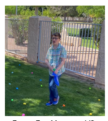
Easter Egg Hunt — 4/9