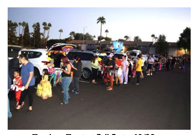
Trunk or Treat at Fall Fest - 10/28