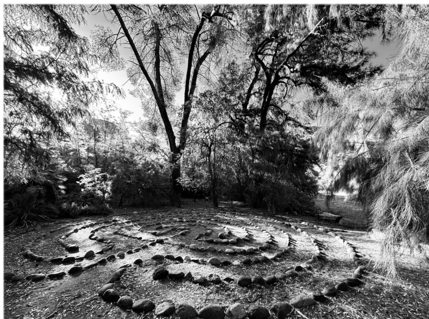
Labyrinth at Boyce Thompson Arboretum

As we step into August 2025, Isaiah 43:18-21 speaks powerfully: "Forget about what's happened; don't keep going over old history. Be alert, be present. I'm about to do something brand-new." This promise finds its fulfillment in Jesus, our guiding light. The winding stone labyrinth in my recent photo from the Boyce Thompson Arboretum reflects this journey—surrounded by trees and bathed in light, it draws us to trust each step under His care.