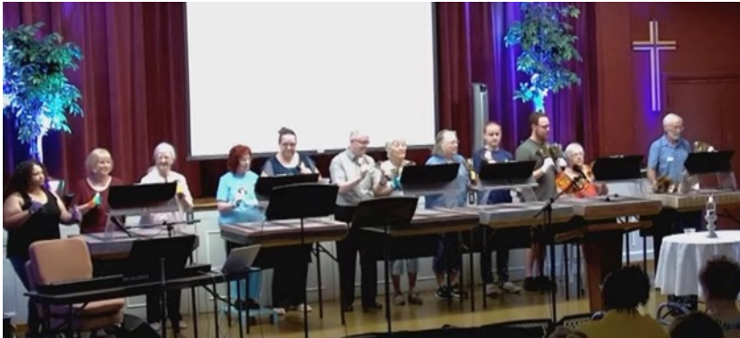
Summer Bells, July 20