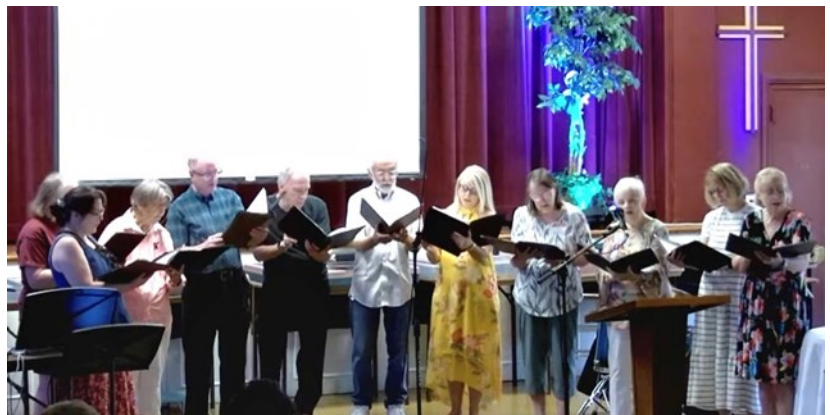
Summer Choir, July 27