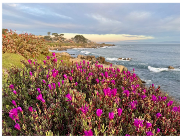
Purple is the color for the season of Lent, and these flowers appeared as on cue