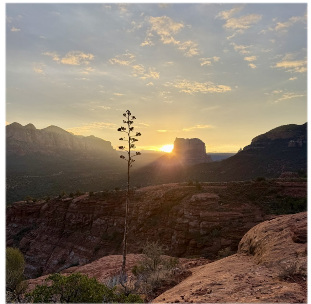
A new day dawns