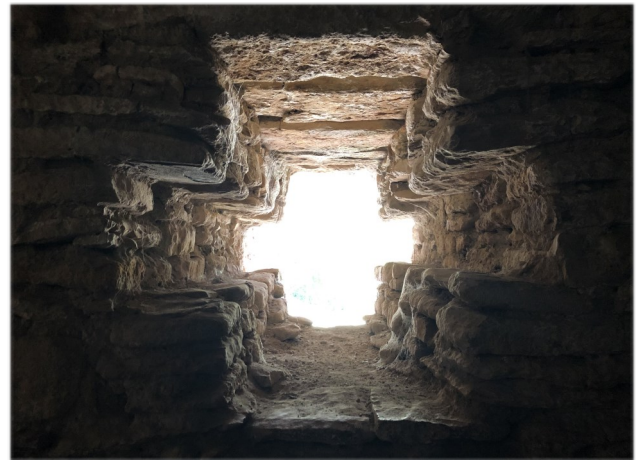
Cross shaped window in ruins in Chiapas, Mexico.