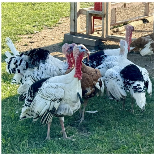
Turkeys I encountered in Walla Walla, WA summer 2024

I remember when my parents brought home a live turkey in a cage in the back of our Pinto station wagon. I only have a few memories that took place in the home that I moved out of when I was 3 and a half years old. However, a live turkey showing up that day in November made a lasting impression on me.