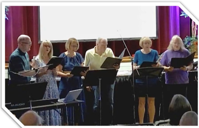
One Voice singing during worship on June 22nd

Thanks to all who help out on Sunday mornings with video, sound, streaming the broadcast, greeters/ushers, and providing refreshments. Wherever you may be this summer, at home, traveling or sitting in Fellowship Hall on Sunday mornings, let us continue to worship the Lord together!