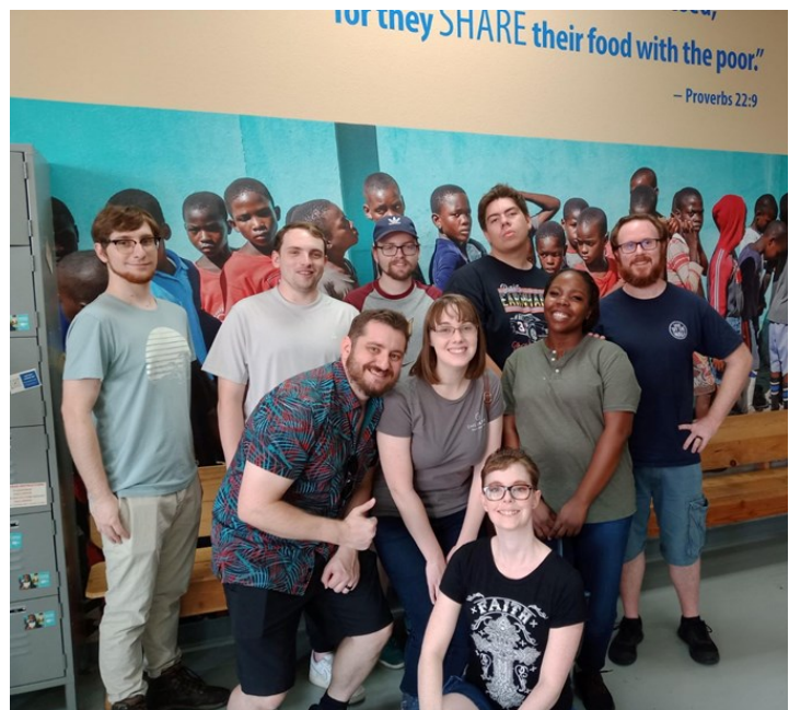
Young Adults at Feed My Starving Children – July 19th, 2024