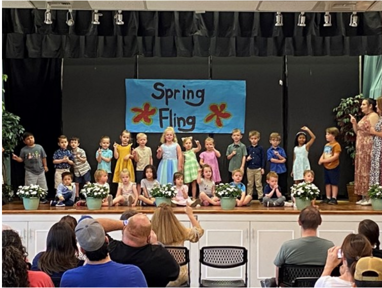
Preschool Spring Fling – May 15th, 2024

We are looking forward to watching our current programs grow in 2025, as well as inspiring and nurturing the more home-grown approach we have taken to fostering Christ in the lives of our congregation, no matter the age.