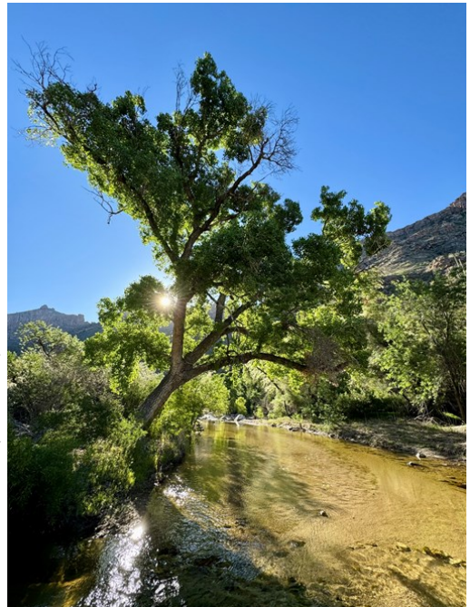
Cottonwood next to Sabino Creek

Discipleship is not just an add-on to our lives; it's the very heart of what it means to follow Jesus. It's about allowing His teachings to permeate our thoughts, actions, and interactions. Think of a plant in the desert, struggling to thrive. It needs deep roots in a creek bed or wash to find nourishment and stability. Similarly, we, too, must dig deep into our relationship with Jesus, drawing from His Word and engaging in prayer, to flourish in our faith.