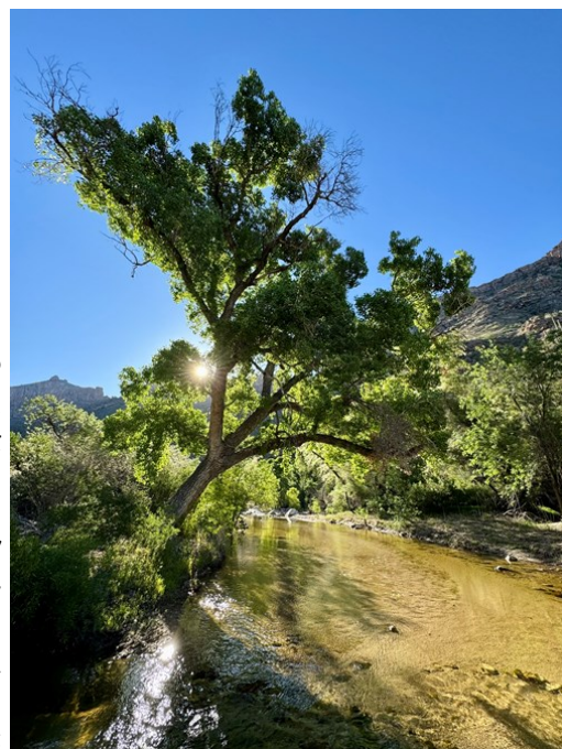
Cottonwood next to Sabino Creek