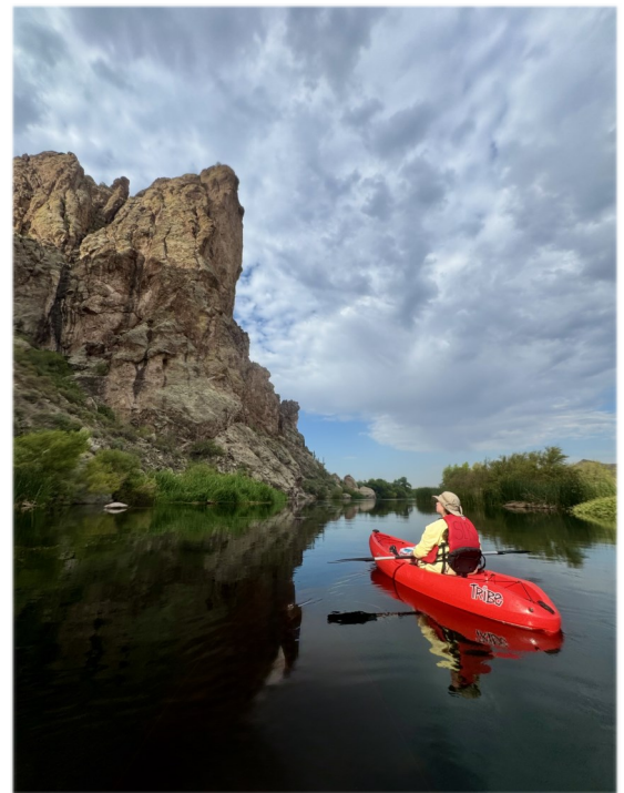
From a recent trip down the Salt River