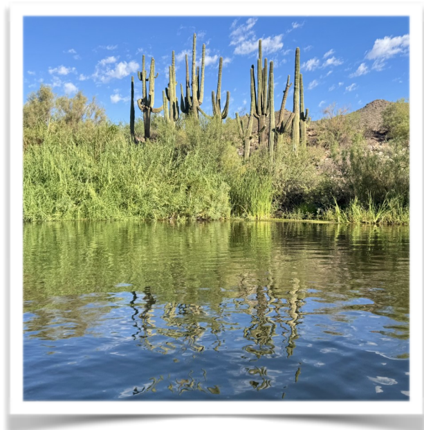
Saguaros, resilient and enduring, are sustained during the scorching summer by the life-giving waters of the Salt River.

As you rest and recharge this summer, I invite you to consider a few gentle questions: