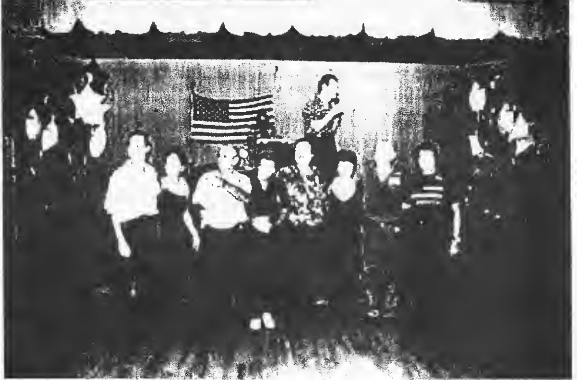
S.F.S.D.S. BOARD OF DIRECTOR (2002)