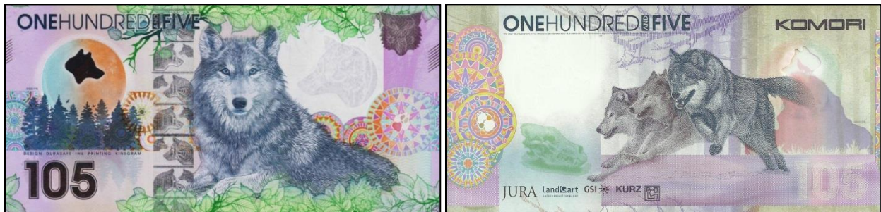
KOM-251 “Lupo” , 77x163mm.test note. Jura, LandQart, GSI, & Kurz all have versions of this note as well with their name at top right on reverse. The note was jointly produced by the five firms.