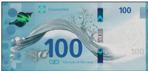
LOU-211aD / GD-481aD test note