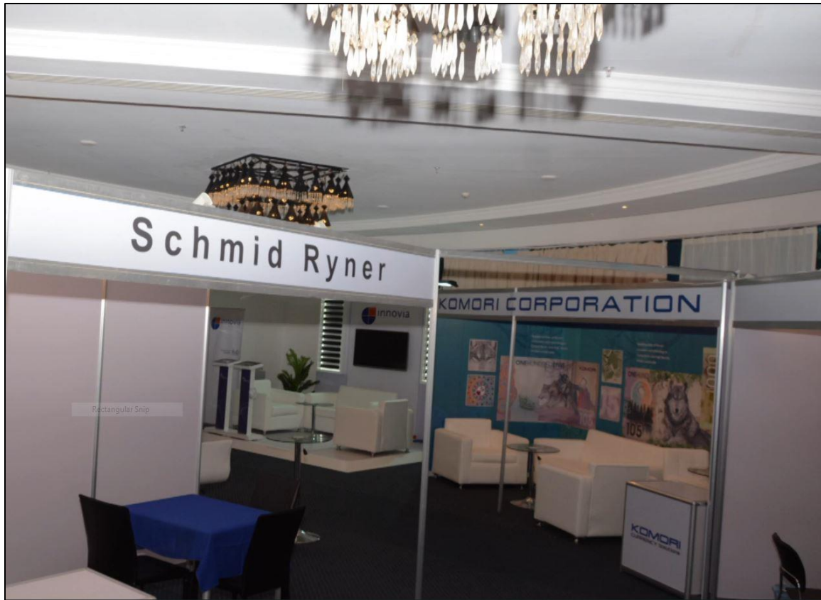
Schmid Ryner & Komori kiosks. Note Komori “Lupo” test note on background wall. Schmid Ryner has 5 known test notes as well.