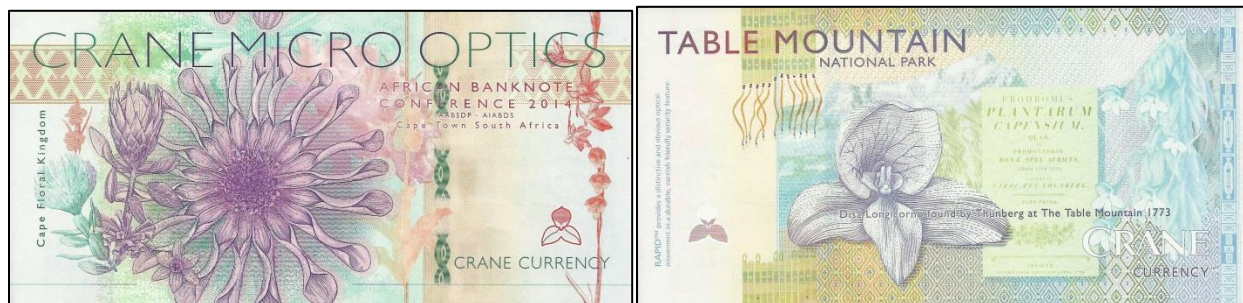
CRAN-222, no Units, Rapid® flower, 75x160mm.

This Crane example was produced for Association of African Banknotes and Security Documents Printers Conference in 2014. A similar note with a different reverse was produced and distributed as a season's greetings.