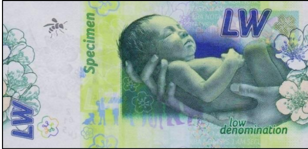
KBA-171. It is the new low denomination KBA-NotaSys house note.