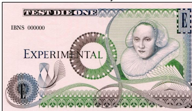
DEB-101d E Units, Experimental, 91x162mm. The reverse is blank.

This Debden example has an IBNS prefix and serial number added for a 1993 IBNS function from a test note made in 1986. In 1987, a larger dimension variant note was given away at the British Museum display of British banknotes from a proof press demonstration. Does anyone know what IBNS venue this overprint note was made for?