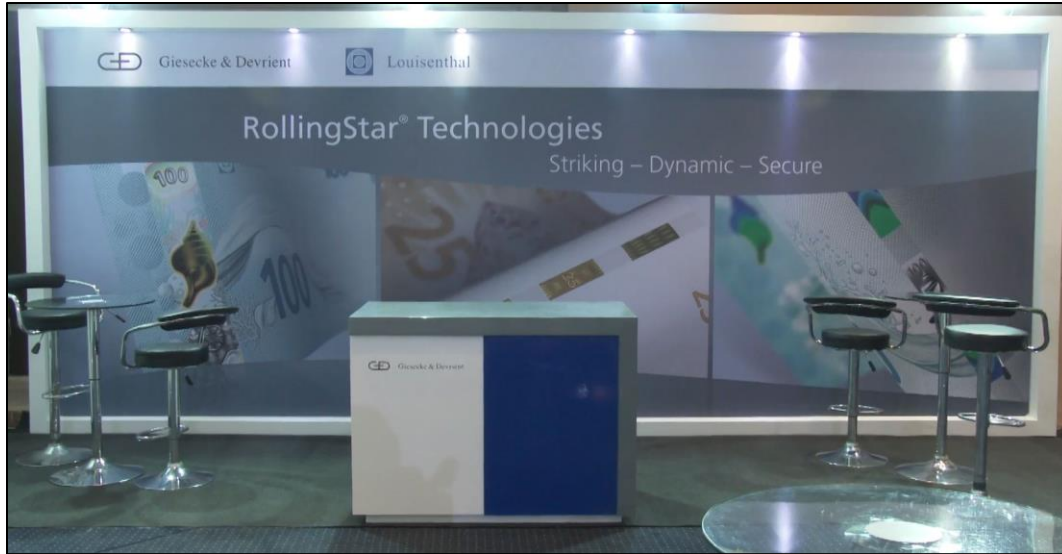
Louisenthal and Giesecke & Devrient kiosks.