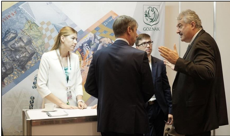
Goznak kiosk at High Security Printing Conference – Reconnaissance, Mexico City, Mexico, 2016