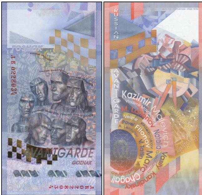
GOZ-371a “Avantgarde” test note. 80x151mm. There are 8 varieties of this note.

Here is the Bluebird test note - the topic of discussion at the Jura kiosk.