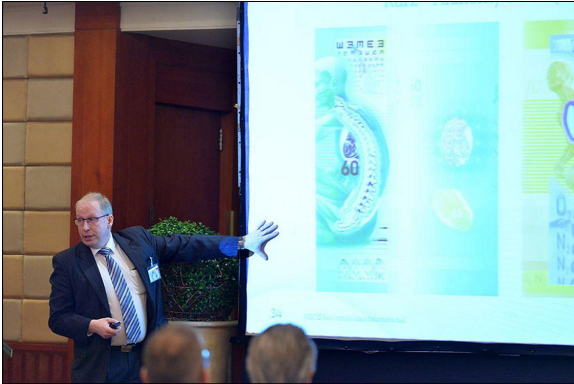
Kurz session using Kinegram Colors test note at High Security Printing Asia – Renaissance in Manila in 2014.