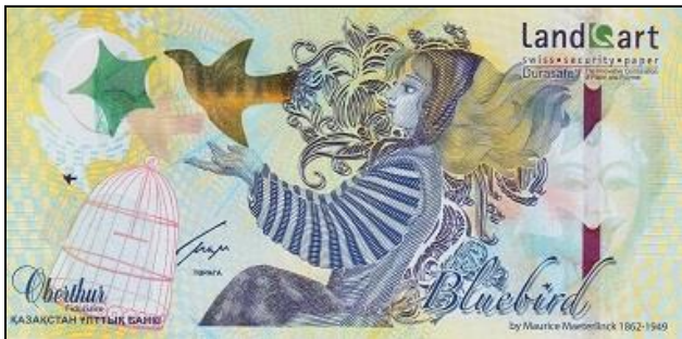
FCO-251bD, KAZ-141bD, and LAND-131bD 83x155mm test note.

A jointly produced test note series by Francois-Charles Oberthur Fiduciaire, Banknote Factory of Kazakhstan National Bank, and LandQart. There are 3 varieties of this note.