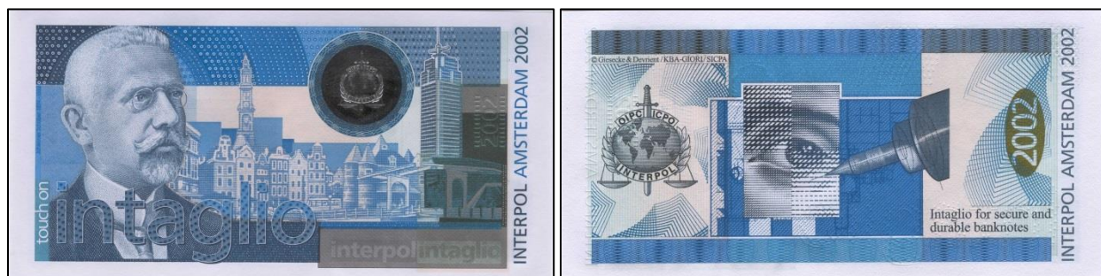
GD-181D, SiCP-241D, and GIOR-421D, no Units, Intaglio, dimensions unknown.

This test note was made specifically for the Interpol Amsterdam meeting in 2002. It was produced jointly by Giesecke & Devrient, SICPA, and Giori.