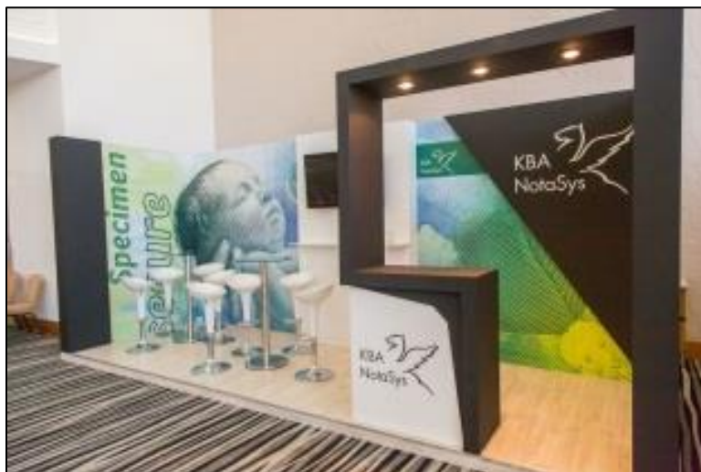
KBA NotaSys kiosk at Watermark Conference, Sochi, Russia, 2015