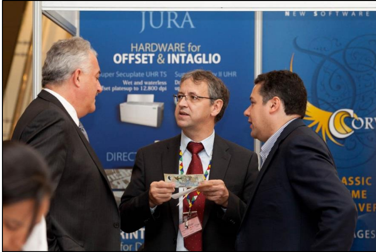
Jura kiosk at African Banknote Conference - Cape Town, South Africa in 2014