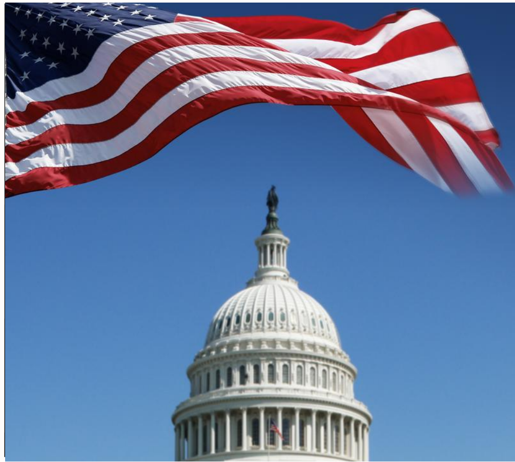
American flag over the U.S. Capitol in Washington, D.C.

We support longstanding agencies dedicated to peacebuilding activities, including but not limited to: