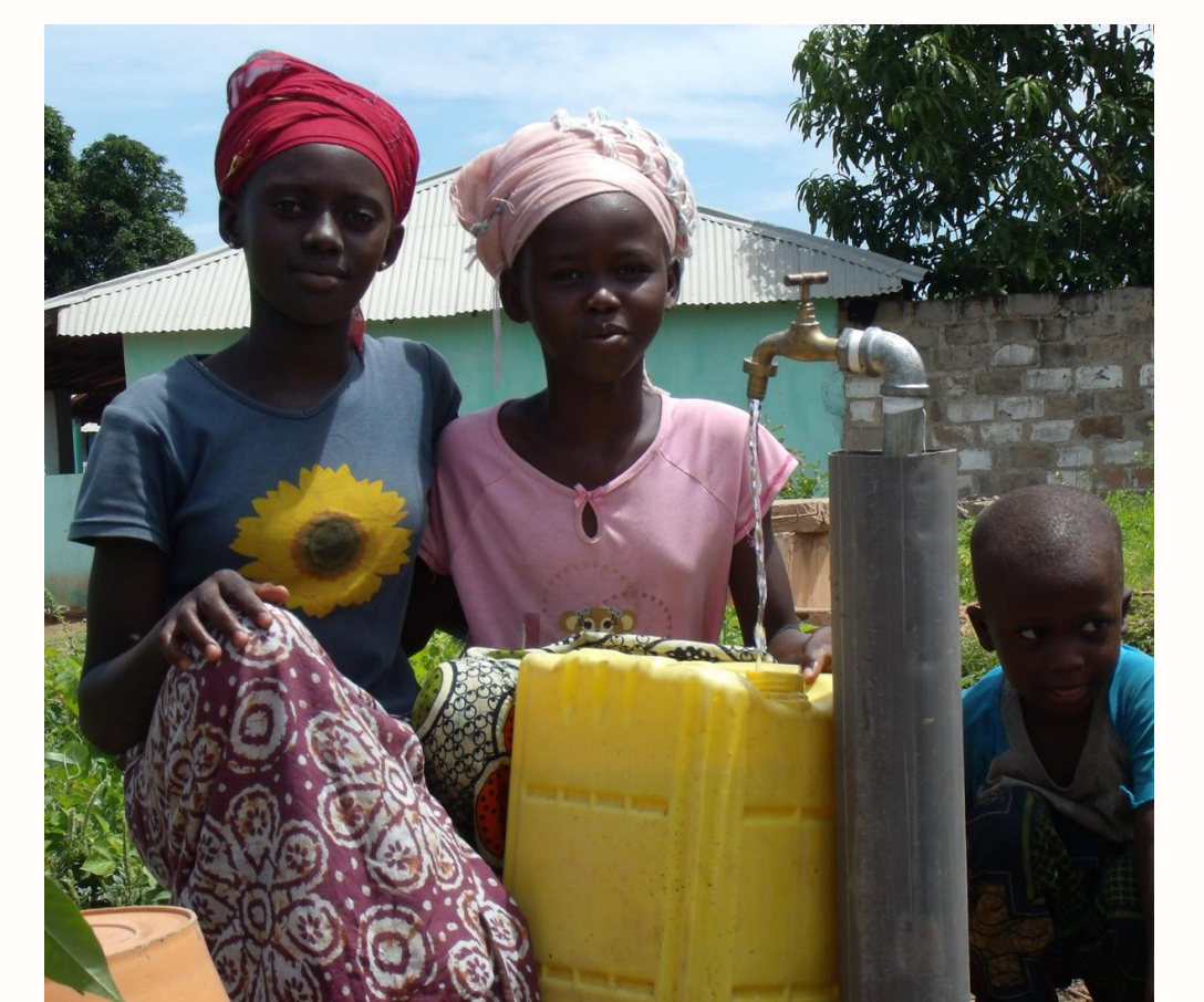
Children gather clean drinking water from solar-powered borehole well built by PCVs in The Gambia, 2012.