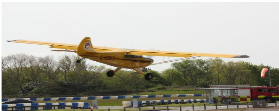
Our aeroplane landing at the famous Brooklands Museum last year

P.S. I am now considering training to become an observer ..... watch this space!