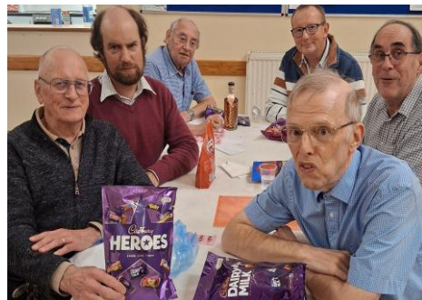
a magnificent score of 53 points.

Couldn't make that one? Then make a note now of the next one on December 15th 2026 to avoid disappointment.