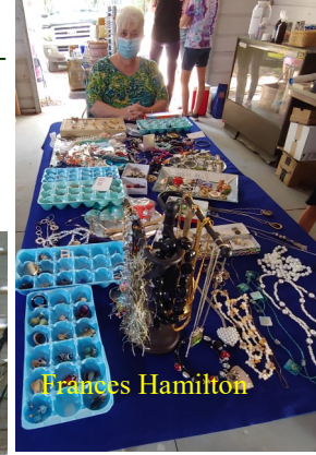
Sandy Boyette took a few minutes to show off some of the treasures that we gave up so others could enjoy!!

Bonnie Jessee , along with the whole work crew, sorted clothes by sizes to make them more readily accessible to shoppers. In spite of many, many purchases, we have A LOT of clothes awaiting the next sale (whenever that happens!)