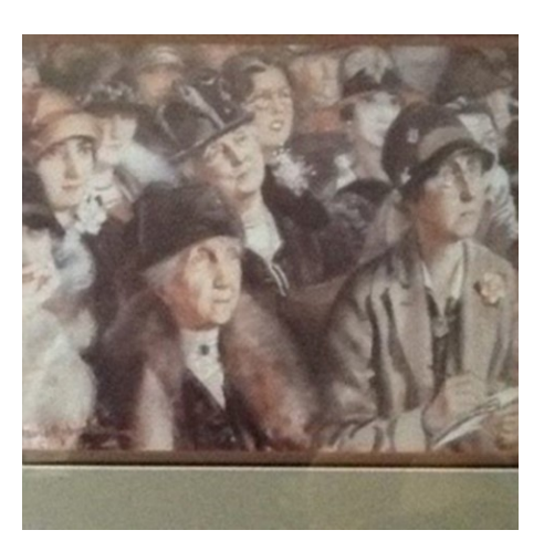
The Woman's Club

Following the formal opening of GFWC Headquarters in January 1923, individual clubwomen and State Federations began to donate fine furniture, art work, silverware, and books to help create a more "home-like" environment.