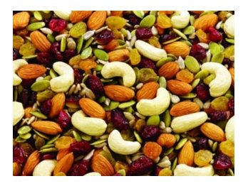
Healthy Mix Visit our web page www.gfwcinvfl.org