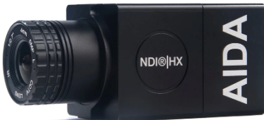
AIDA "Cube" wide FOV NDI camera - default

AIDA "Cube" is a wide FOV (field of view) camera with replaceable fixed focus lens options. "Cube" provides an ideal feed for a "birds-eye-view" performance space display. Nearsighted technicians work better, when given high quality/close range video, coupled to a large screen display in their workspace.