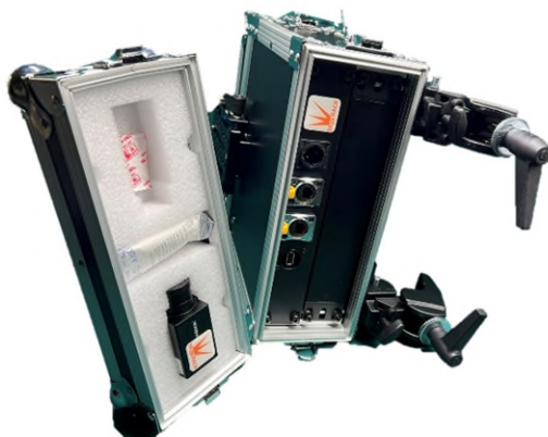
Truss Box w/ stored camera & mounting clamps shown