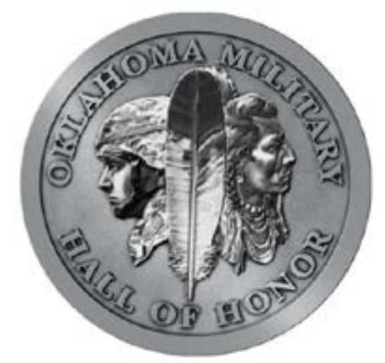
Emblem for the newly-introduced Hall of Honor Award that allows the Oklahoma Military Heritage Foundation to involve communities across the state in honoring more veterans.