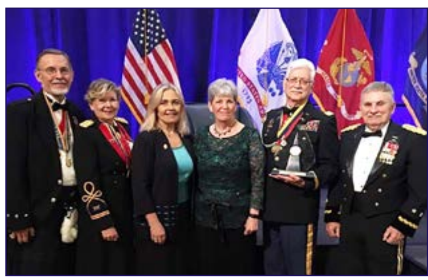
Oklahoma Military Heritage Foundation Board members were present at the 2019 Force 50 Foundation ceremonies on the University of Central Oklahoma campus to receive the small nonprofit organization award for service to the state's veterans.