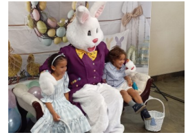
KIDS EASTER PARTY 2023

Unlike most communities in South Florida, we are not an HOA. There are no mandatory fees. ALL RESIDENTS of Florida Gardens are members of the Florida Gardens Civic Association, and your voluntary annual contribution to the FGCA makes it possible to provide you and your family with events that bring our community together and make Florida Gardens such a great place to live. Even if you don't attend any of our family events, the community still needs your support. We ask for a contribution of at least $50 for the year, but ANY contribution amount is greatly appreciated. We Sincerely Thank You.