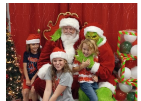
KIDS XMAS PARTY 2023

SEE ALL THE EVENT PICTURES ON OUR WEBSITE