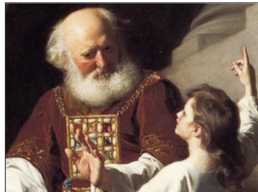
Sunday, January 14 - Second Sunday in Ordinary Time Mass - 9:00 a.m. English – Mass - 12 Noon Spanish