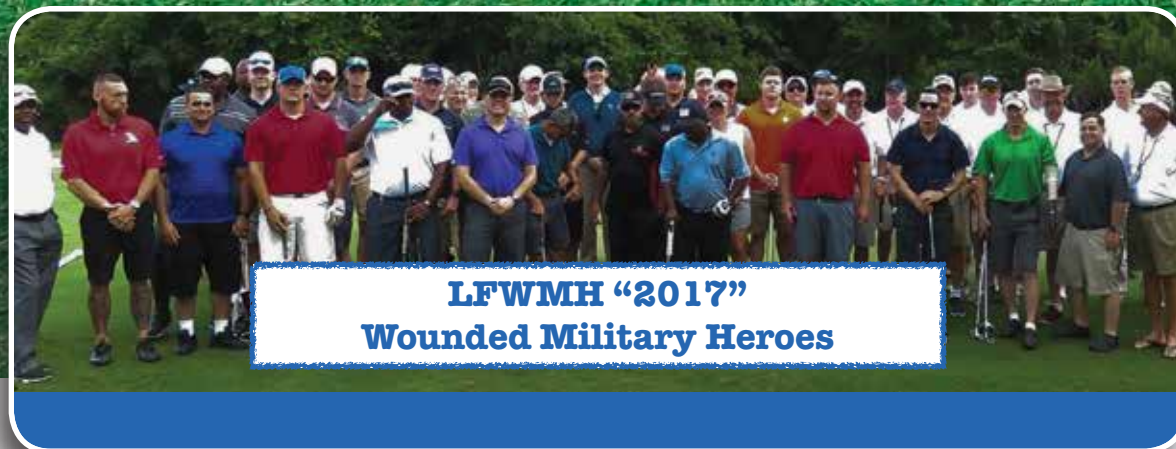
LFWMH "2017" Wounded Military Heroes

May 21, 2018 Hampton Hall and Belfair Clubs, Bluffton, South Carolina