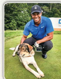
TIGER WOODS AND BELFAIR

For the 10th year in succession, the Wounded Heroes Golf Classic will be held at the Hampton Hall Pete Dye Signature Course. In order to accommodate the growing demand for this popular event, and for the fourth year in a row, it will also be held at the Belfair Golf Club for our Belfair supporters and residents.