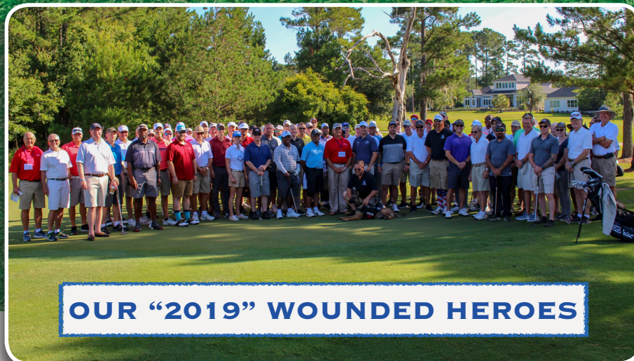
OUR "2019" WOUNDED HEROES

May 18, 2020 Hampton Hall and Belfair Clubs, Bluffton, South Carolina