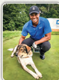
TIGER WOODS AND BELFAIR

For the 10th year, the Wounded Heroes Golf Classic will be held at the Hampton Hall Pete Dye Signature Course. In order to accommodate the growing demand for this popular event, and for the very first time, it will also be held at the Oldfield Golf Club.