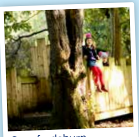
Crawfordsburn Country Park