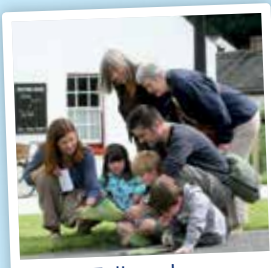
Ulster Folk and Transport Museum