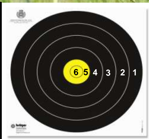
A Field Target Face

This should give you an idea of what is involved in a field shoot and the best way to find out more about field archery is to take part in a shoot.