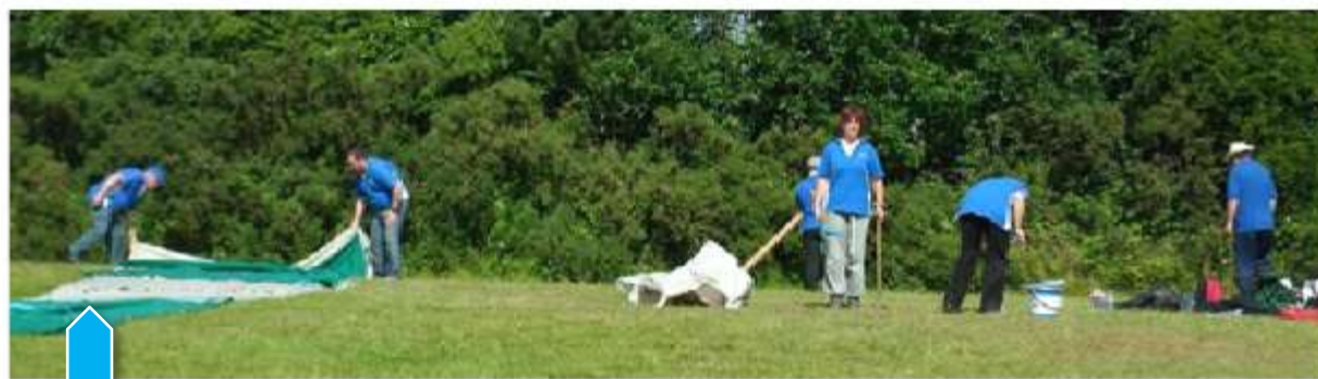
Getting ready to have a go at Tesco – after all, 'every little helps'

Lough Cuan Bowmen and women helping everyone one to have a go at Tesco