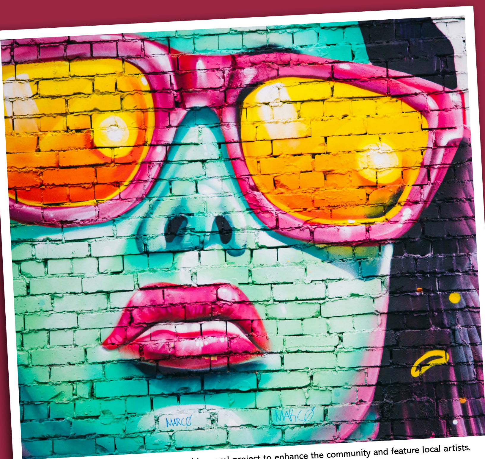
CAC sponsored a city-wide mural project to enhance the community and feature local artists.