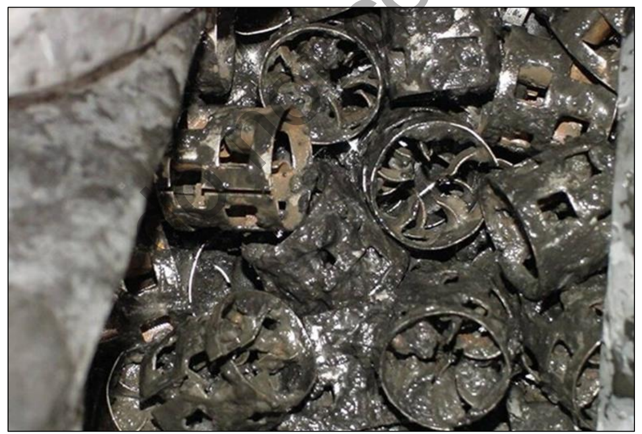
FIG. 2. Deposits by suspended solids in column pall ring packing.

Corrosion. In amine units, corrosion is continuously caused during the removal of H_2S or CO_2 if carbon steel is present in the circuit. In some cases, corrosion can occur if the unit contains stainless steel. Passivation of metal surfaces by H_2S is key for amine units; this is one reason why amine units only used