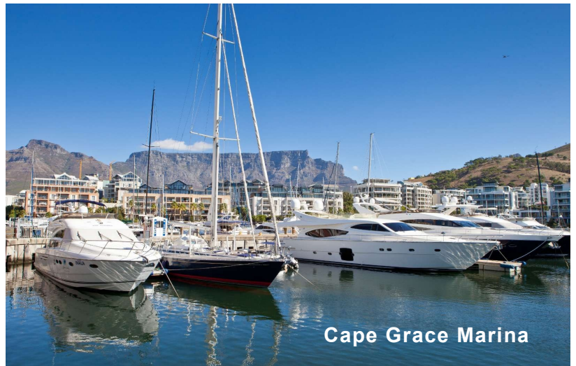
Cape Grace Marina