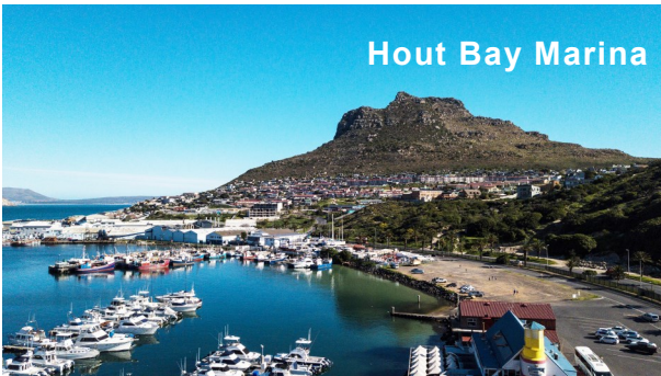
Hout Bay Marina