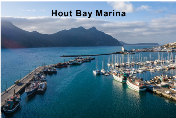
Hout Bay Marina