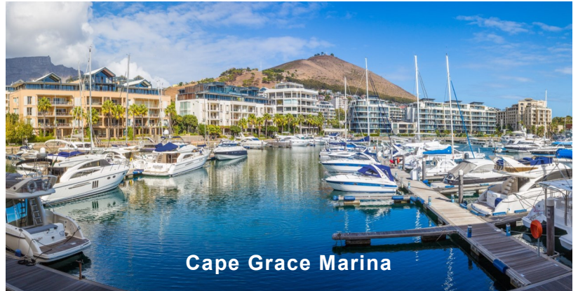
Cape Grace Marina