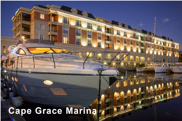
Cape Grace Marina