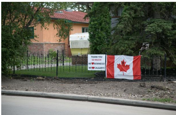
Residents show their pride in community, country and resilience after the June flood damaged many homes and streets in Bowness.