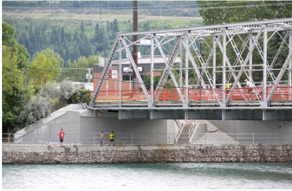
The Shouldice Bridge in Bowness. At the time of the June 20 flood, the raging Bow River nearly touched the bottom of the bridge's surface.