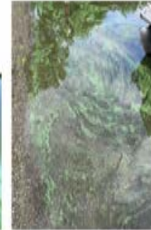
North Cove - June 2024