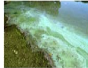
North shore – September 2009