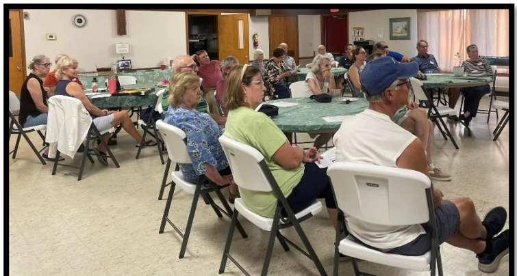
Kettle Lake "Get Together" at the Tully United Community Church, June 20th