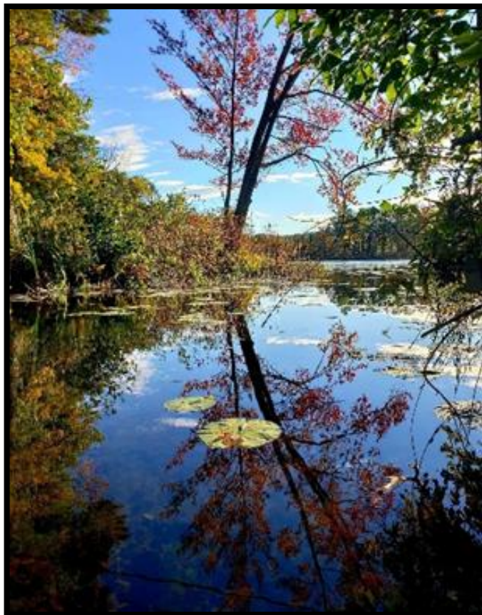
This year's winning photo contest entry.