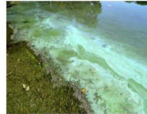
North shore – September 2009