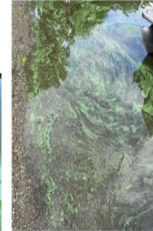
North Cove - June 2024