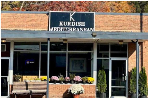
K Kurdish Mediterranean

A huge shoutout to the generous local establishments that supported this event and the raffle. Please be sure to support our local establishments.