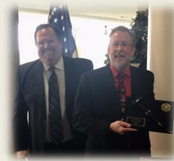
The S.O.S. Club in Modesto December 9, 2016