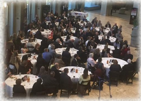
Another great Law Day Luncheon at the Gallo Center thanks to all of our generous Sponsors!