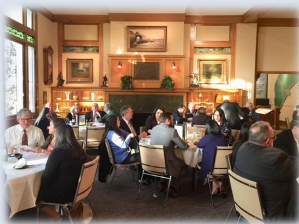
Beautiful McHenry Museum enjoyed by guests.