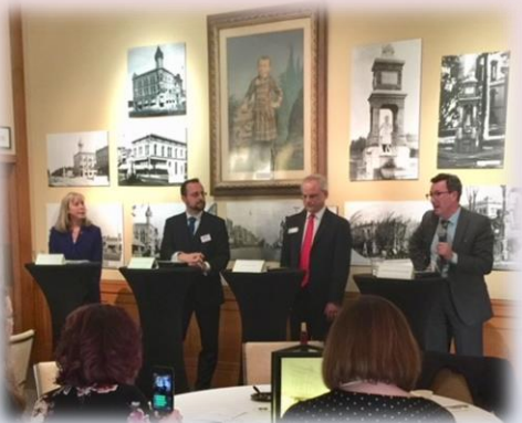
Stanislaus County District Attorney Candidates debating