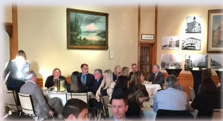
Guests relaxing and socializing prior to D. A. Debate.