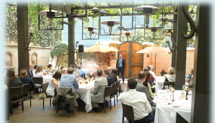
The Honorable Robert Westbrook