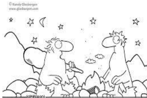
"I invented fire, but now everyone is using it for free. In hindsight, maybe my first invention should have been intellectual property law."

Family Law secretary position currently available. Req's: Extensive family law experience, knowledge of WordPerfect, Legal Solutions; Persons will also be responsible for answering telephone, meet and greet clients. Part or full time. Send resume by mail only, to: 520 13 th Street, Modesto CA 95354.