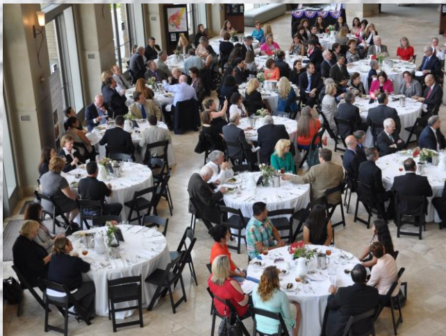
Gallo Center for the Arts, Modesto CA