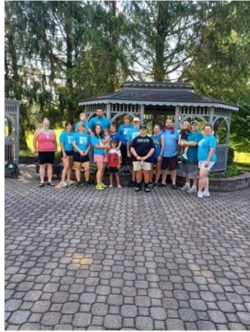
Faith Life Newark Small Group