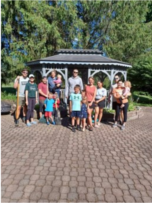
Pound Family Small Group