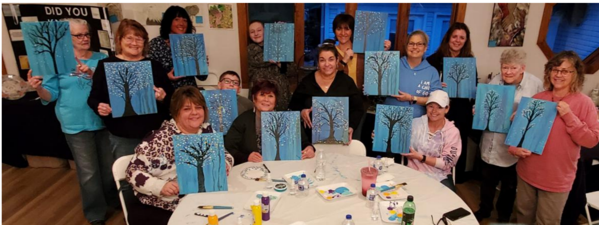
Masterpieces from our first paint party

Space is limited to the first 50 people who would like to participate. If you are interested in attending, email us at contact@kpstrongtower.org