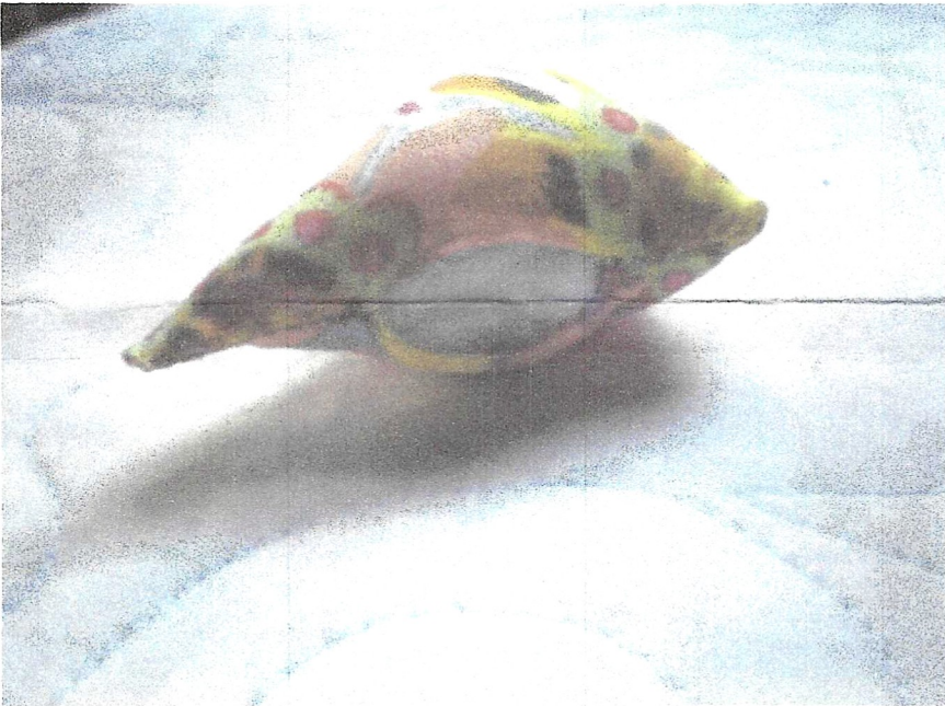
6. Bring the points together and mold into shape. Check for correct size - you can fiddle with the tips of the corners by tucking them in to make it smaller or turn out further if you need it larger. Once it fits comfortably on your finger sew the points together securely.