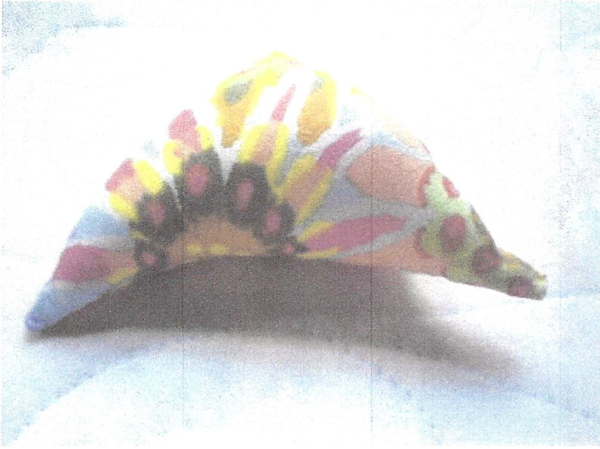
5. Stitch opening closed.