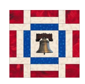
This is a 10" finished block!