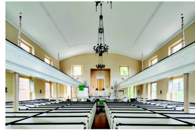
Old St. George's in the 18th century, as it appears today after the 1926 erection of the Benj. Franklin Bridge requiring evacuation of 4th Street. The Sanctuary, as required by Federal law, is as Washington, Adams, and other Founding Fathers would have remembered it.

Church Within Independence National Historical Park, Old St. George's is America's first and World's oldest Methodist Church. The sanctuary appears today as it did in colonial times. Washington, John Adams, Benjamin Franklin, Benjamin Rush and Robert Morris worshiped here. Betsy Ross was a member. Responsible for several "firsts" in American Methodism, St. George's started the first Methodist bookstore and Methodist Home Missionary Society and was also the first to appoint a woman to the role of class leader and to license African Americans as Lay Preachers of Methodism (Richard Allen and Absalom Jones, 1785). Sunday school instructor Anna Jarvis established Mother's Day here. The last President believed to have visit St. George's was Calvin Coolidge on July 5, 1926. President Dwight Eisenhower was instrumental in saving Old St. George's signing into law on June 23, 1959, H.R. 2154. President Ronald Reagan resurrected the Inaugural Prayer custom on January 20, 1985. Being a Sunday, the exchange of the Inaugural Prayer was the only official observation, Reagan being privately sworn. President George H.W. Bush incorporated the Inaugural Prayer into his address. President George W. Bush's Inaugural Prayer was exchanged on January 21, 2001. Neither Presidents William Clinton or Barack Obama White House officials resolved logistics to deliver their prayers.